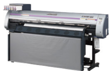
CJV30-160 equipped with a drying and exhaust unit 160